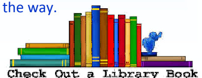
Check Out a Library Book

Yes, the library is open (though the setup is not yet complete) and you can come by and check out a book! Several comfortable chairs are provided where you can sit and relax at your leisure. Students using the Homework Club have been by a couple times seeking reading material. Willy Wonka is currently out on loan, by the way.