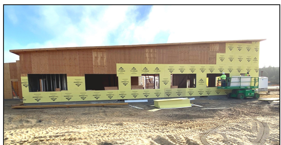
Top: Walls rise around the wellness center's interior courtyard.

Above: Yellow fiberglass-coated gypsum wallboard covers the exterior walls, providing strength and resisting moisture.