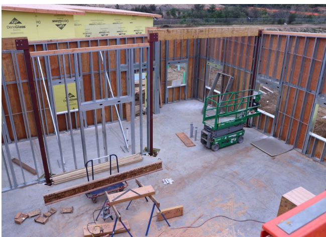
A view of the interior from atop a scissor lift.