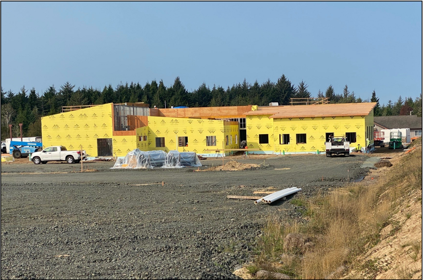
Pipes and ducting wait their turn for installation.