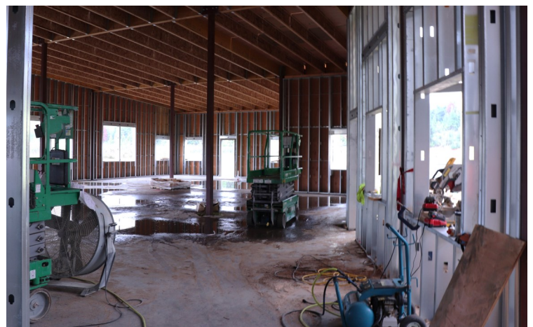
Newly applied plywood subroofing covers Family Health.