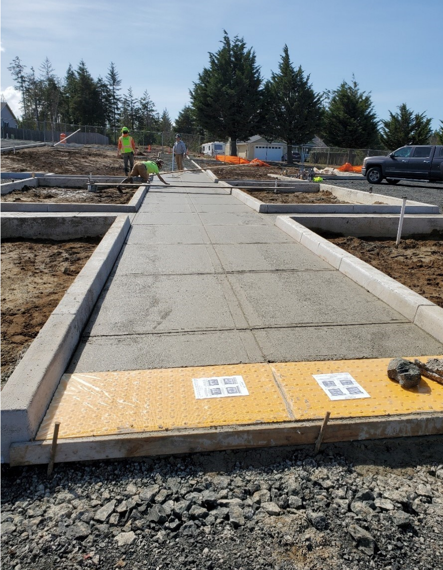
The concrete crew finishes smoothing a stretch of sidewalk near the main entrance.