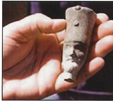
Historic Pipe Bowl from Fort Lane, Southern Oregon

This brochure was developed by the State-Tribal Government-to-Government Cultural Resources Cluster, composed of State Agency and Tribal representatives, charged with coming together to share information, discuss common issues regarding cultural resources, develop and strengthen partnerships and increase awareness of cultural resource concerns